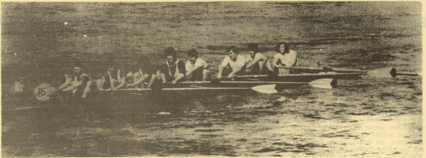
Imperial College Eights victorious at the Allom Cup Regatta, May 1979.