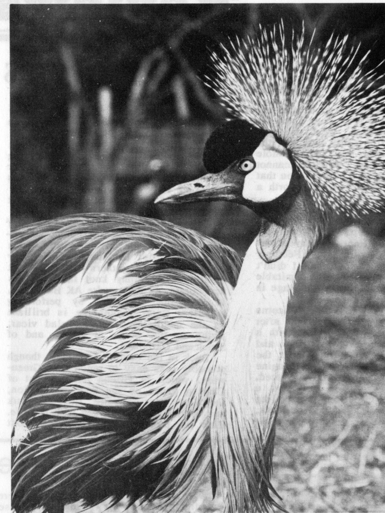
2nd General by RM Smyth