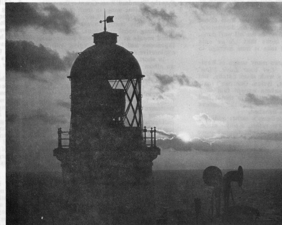
1st Landscape. The Watch by JP Gilbert