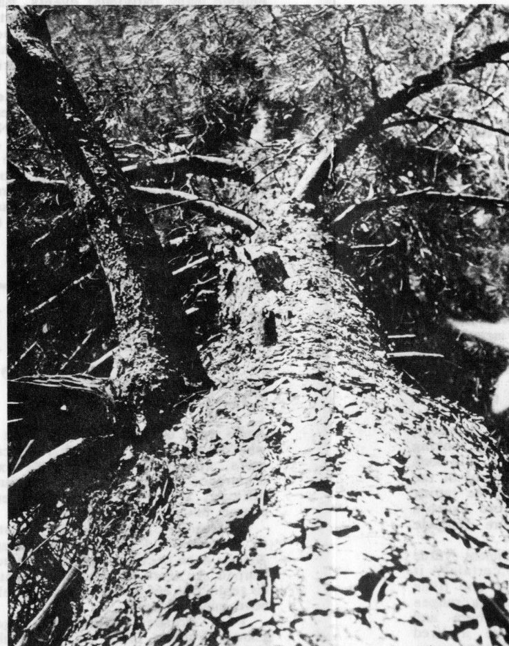
1st General. Bark!