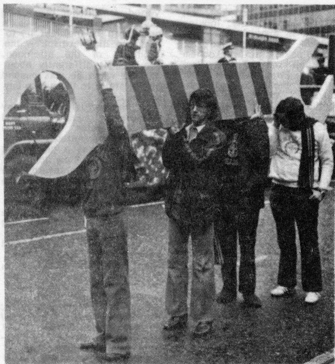
Members of Guilds Union carrying the fourteen feet long wooden replica of Spanner in the procession.

The Lord Mayor's Show 1975 was quite successful despite a few mishaps during the day. However, these did not mar a thoroughly enjoyable occasion in which one of the major land marks was Boanerges' survival throughout the day with absolutely no need for attention. She even achieved 'fame' by appearing on television!