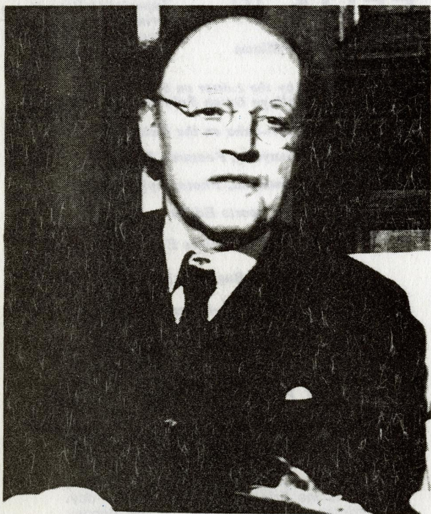
LORD LONGFORD spoke at More House on Thursday 17th October. His theme was 'Crime and Punishment'.