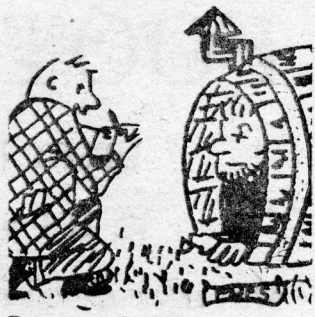
Reporter: And how do you find yourself managing OIT your grant?

thing is a waste of time and that council members would be much better occupied elsewhere. The President was heard to say "it's a shambles" when he left the meeting, but it's really his job to prevent a shambles. Perhaps if he controlled council meetings as he did last term more would be achieved.