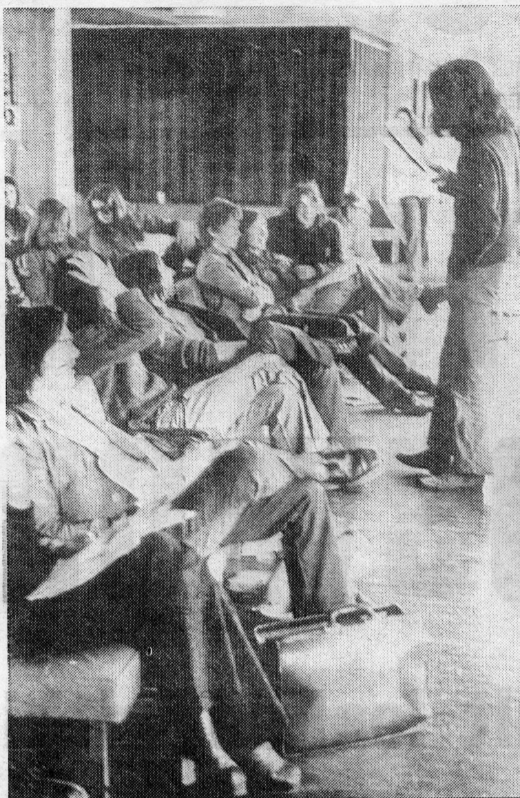
● A section of last weekend's National Union of School Students conference.

How are they then to recruit membership? And, more difficult still, how are they to maintain it? Mr. Leeson suggests that holding a campaign is the only way, and delegates agreed. The question is more one of finding a campaign that school students will feel strongly enough about to mobilise on a significant scale. The only demands in their policy Statement which school students would unite behind are probably the abolition of religious education and school uniform. And these are by no means as contentious as the draft issue in France and other European countries.