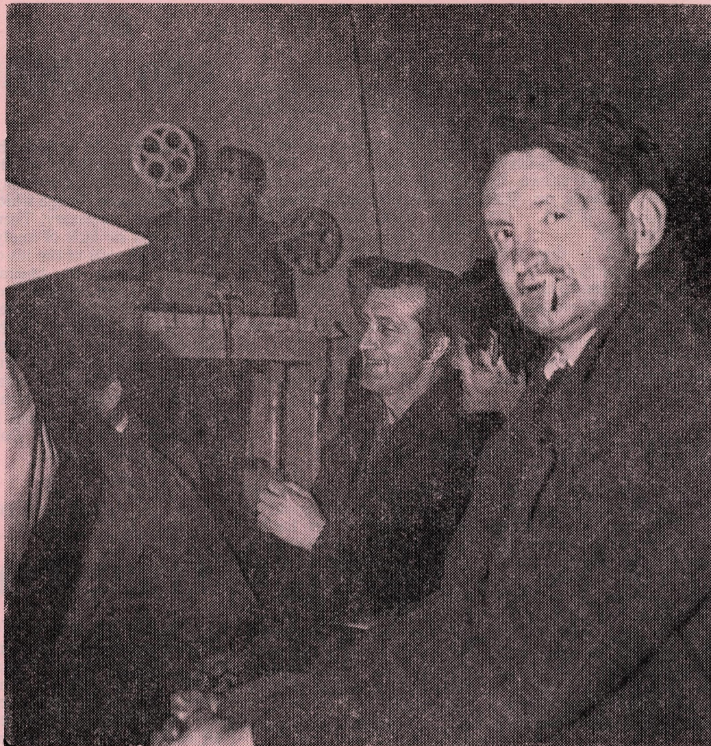
Vagrants at the East End Mission Christmas Film

In some ways the vagrant class functions as a sort of institution which shelters its inmates from the rest of society. Unfortunately the effect of this institution — where society "puts away" those individuals who fail to comply with its minimal requirements — is to encourage its members' decline, physical and mental. Vagrants are brought together by a variety of problems — physical and mental illnesses as well as social difficulties. They are by no means all alcoholics or all anything else. What they have in common is the lack of a home — they sleep in hostels or in derelict buildings. To generalise further without very great care is unjustified.