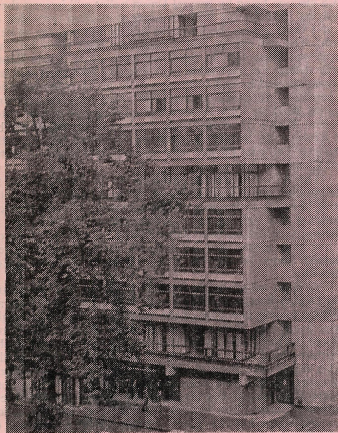
Linstead Hall — Rents up but meals stay the same.

IMPERIAL COLLEGE UNION No. 275 20th MARCH, 1969 6d.