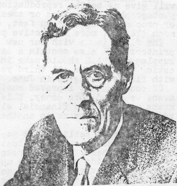
Professor P.M.S. Blackett

The New Year's list brought several honours to people connected with the college, the most prominent of which is the award to Professor P.M.S. Blackett of a life peerage.