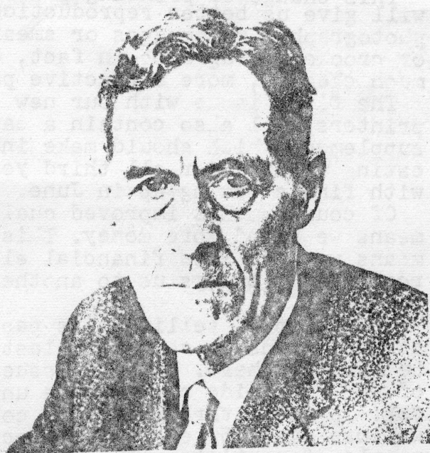
Professor P.M.S. Blackett