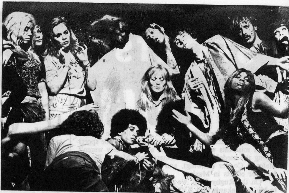
The tribe from HAIR

Why have they gone to all this trouble? The facts revealed in the front part of the book are the more disturbing for being described almost too dispassionately, too clinically. But what, apart from causing horror or giving a rather sick thrill to the readers, do the authors achieve? They feel the issue is too important to remain hidden in obscure Govern-