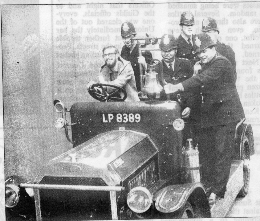
The special branch of R.C.S. Motor Club, training for Sunday's riots, was visited by some officers of the Metropolitan Police already trained to our way of thinking—Jez was not only used for joy-riding, but was commandeered by the sergeant to carry his squad to strategic positions in I.C.

Were it not for the pleasure afforded to parents, it could be argued that the whole farcical and highly expensive procedure could be safely forgotten. However, I'm sure that even they would agree that the whole charade could be easily speeded up without losing any of its essential features.