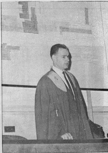
The President speaking to Freshers.

In all one could say that the day was a success although one cannot but think that the whole day is perhaps a trifle overwhelming to the novice.