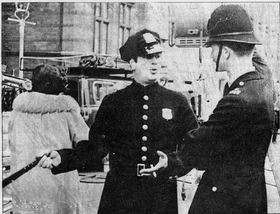
During the filming of "The Girl on the Boat", starring Norman Wisdom, outside R.C.M. on Sunday, our photographer caught this unlikely pair in conversation.