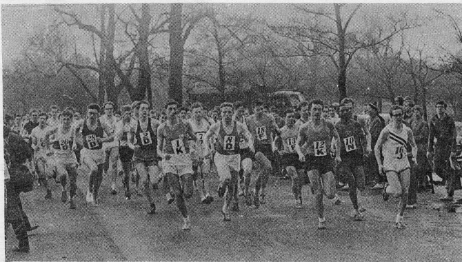
OVER 70 RUNNERS AT THE START OF THE HYDE PARK RELAY.