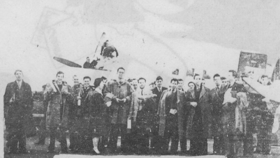
Guildsmen en route from Paris -

It's becoming a habit, now - the Sports Editor has gone there this weekend.