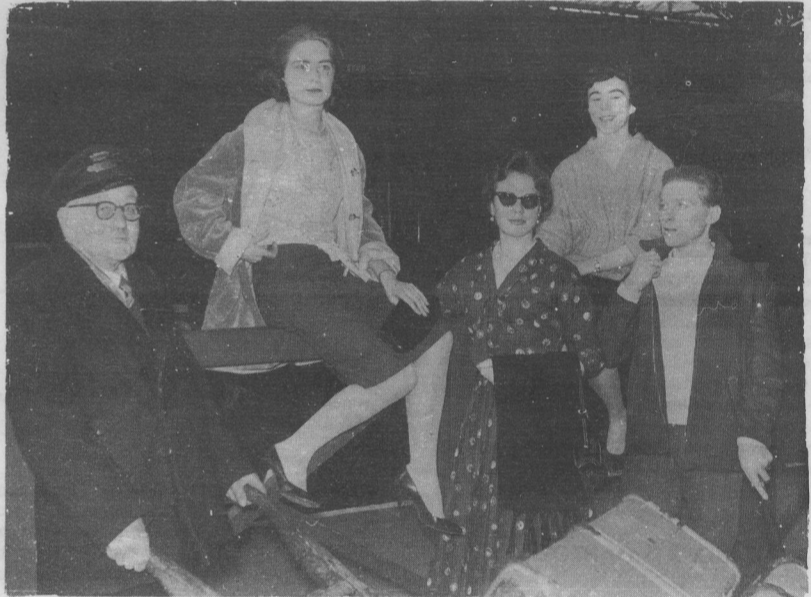
VICTORIA, WHERE THEY PAUSE AWHILE, BEFORE GOING TO TRAFALGAR SQUARE