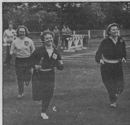
The ICWSC relay team before the Invitation Relay on Sports Day.