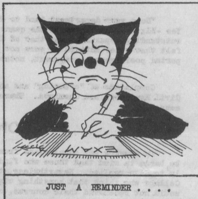
JUST A REMINDER . . . .