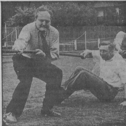
Domestic Bursar and the Rector's Chauffeur pull their weights.....